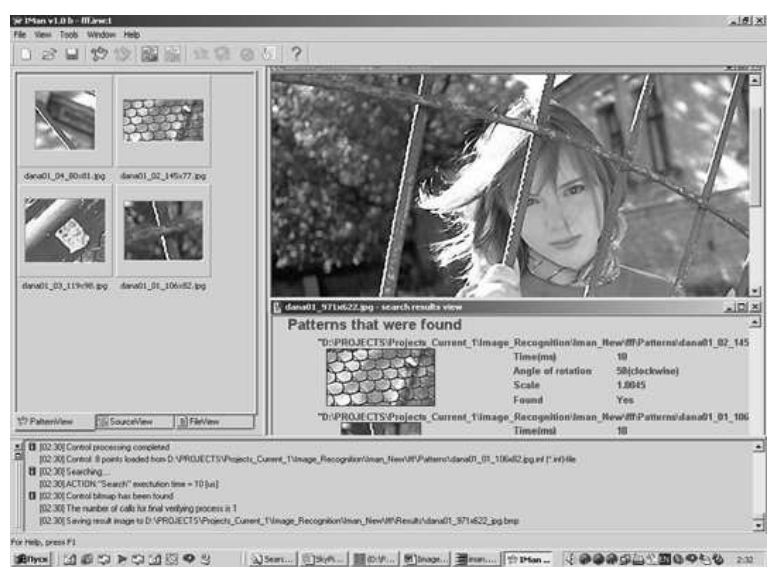
Figure 3. The main window of the program IMan

The basic principles of the "Algorithm Based on Support Points" are described below.