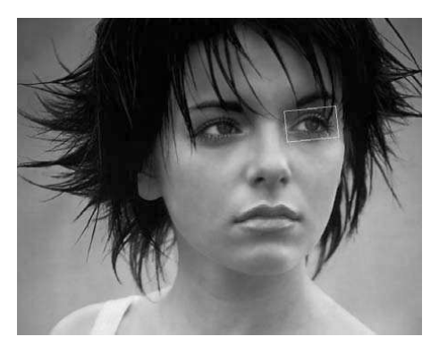
Figure 4. The result of search for a person with a given eye

Taking into account our experience with the images in infrared area, we can conclude, that IMan will work effectively in this case. An example of application of IMan is given below.